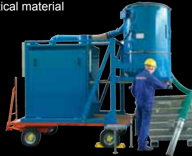
S-1700 E Mounted on an inplant trailer with slide gate DN 800 mm, for critical material