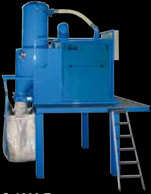
S-1200 E Mounted on a platform with BigBag filling device