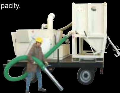
S-2100 Diesel VA 2,5 Mounted on a two-axle trailer for public roads. Collection container with inclined floor and 2.5 m 3 capacity.