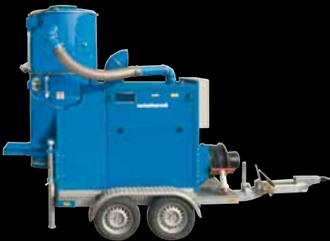
S-2100 E Mounted on a tandem trailer Discharges downwards