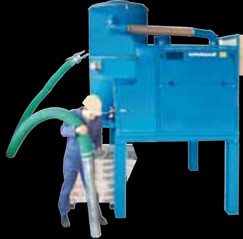
S-2100 E Mounted on a platform. Discharges into open containers