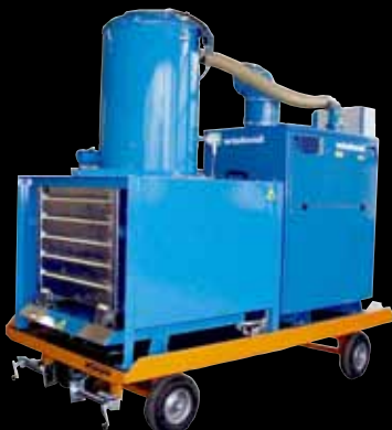
S-1200 E Container Mounted on an inplant trailer with detachable 1000 l container. Transport and discharge of the container by forklift truck.