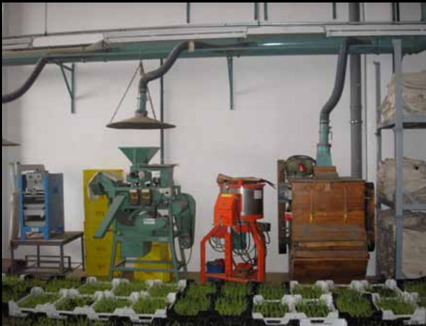
Central vacuum extraction of several machines