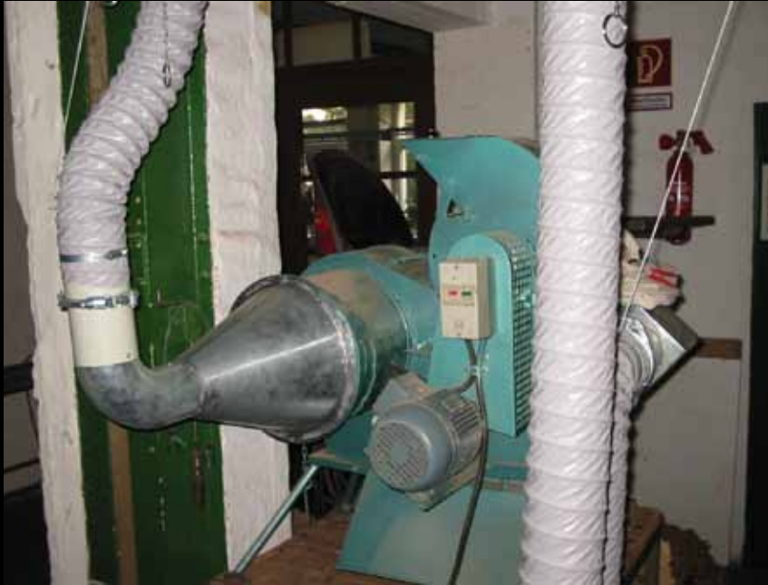
Vacuum extraction of a threshing machine

Wieland vacuum systems: A perfect solution for your seed production plant. Also available with ATEX equipment for explosive dust.