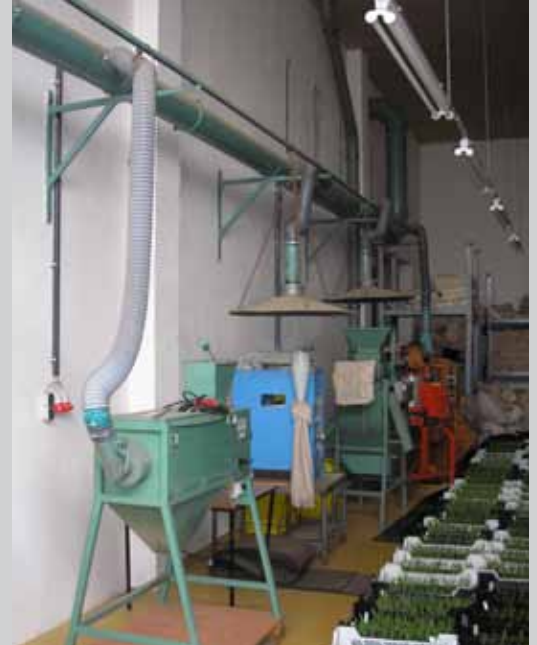
Vacuum extraction of an air separator

Wieland vacuum systems: A perfect solution for your seed production plant. Also available with ATEX equipment for explosive dust.