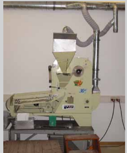
Vacuum extraction of an air separator